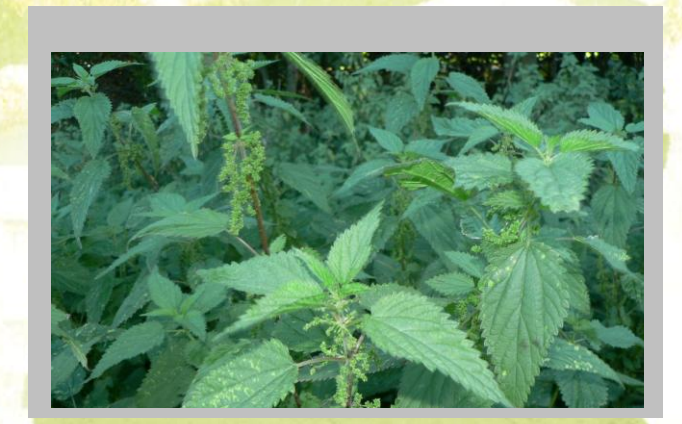
Stinging Nettle for great bone health!