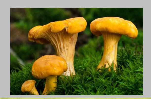
Chanterelles – Edible Be sure chanterelles you are identifying are not the false chanterelles!